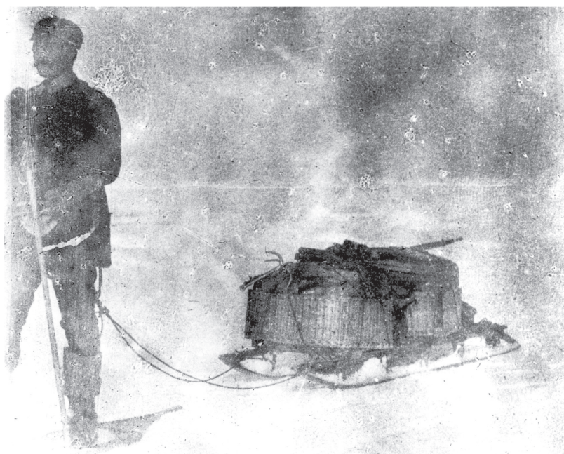
[Fig. 2 and 3]